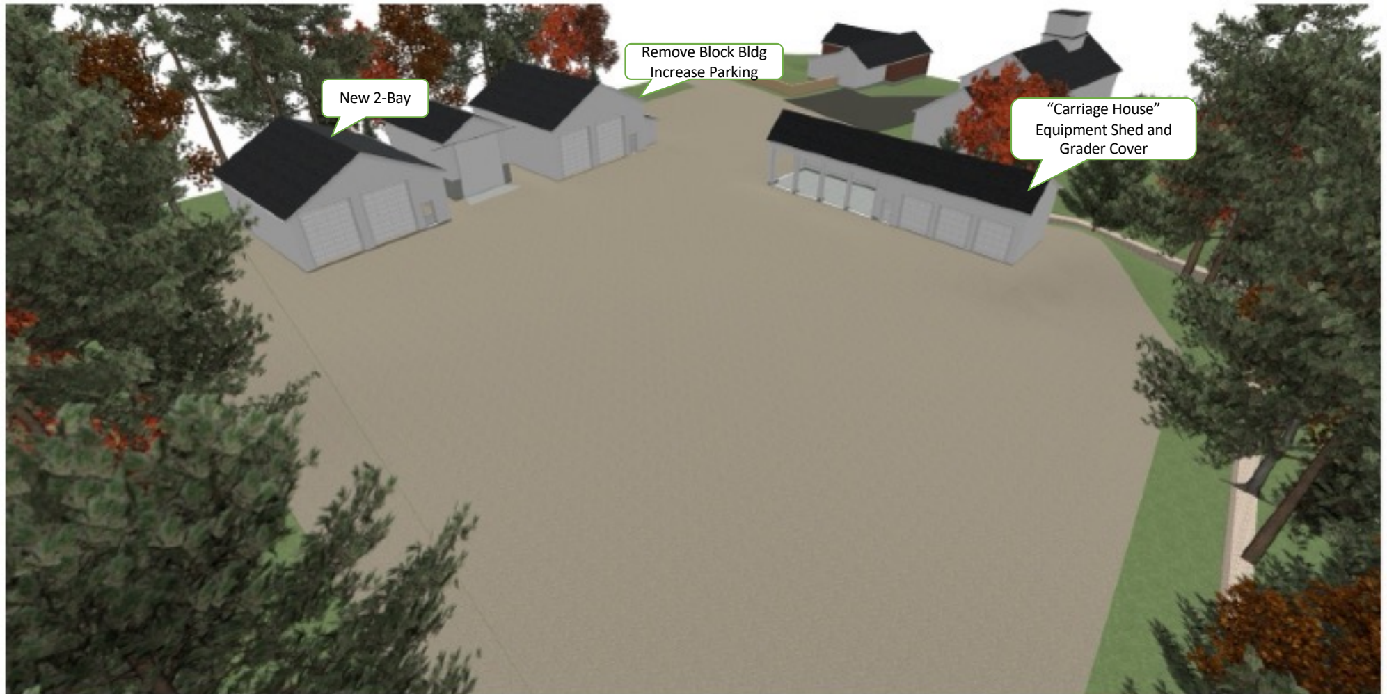
Concept drawing for Option 4