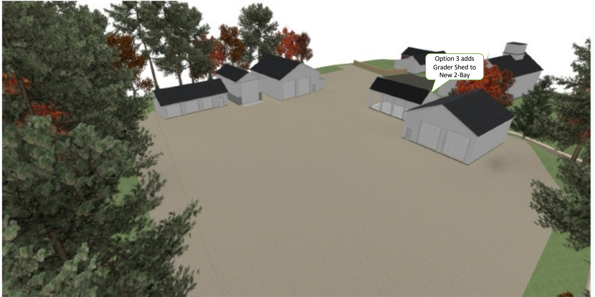
Concept drawing for Option 3