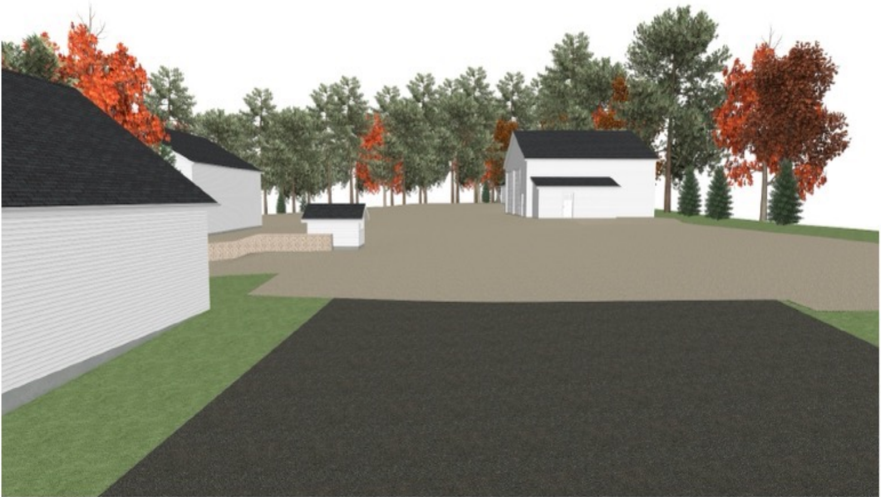
Concept drawing for Option 2 – View from Library Driveway