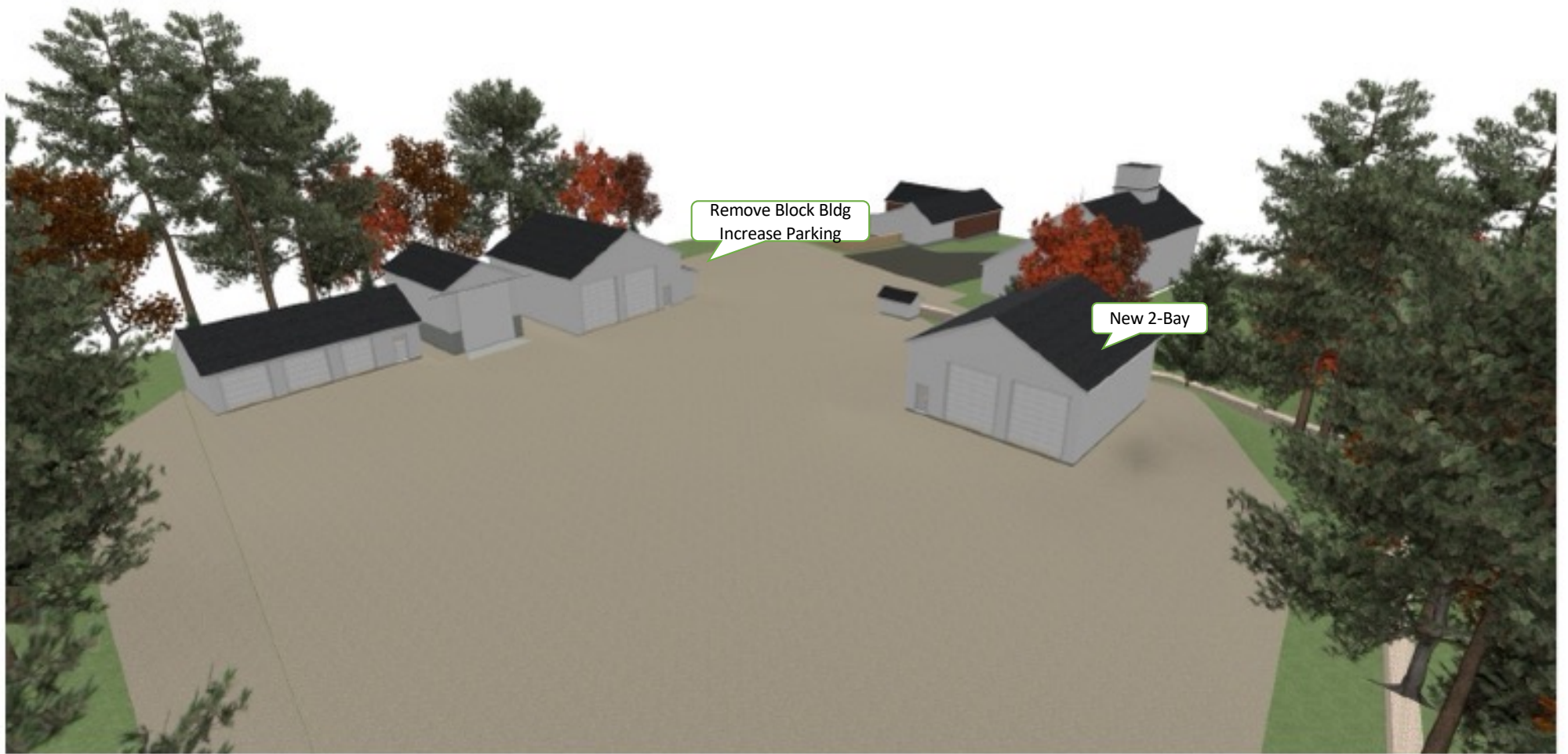
Concept drawing for Option 2