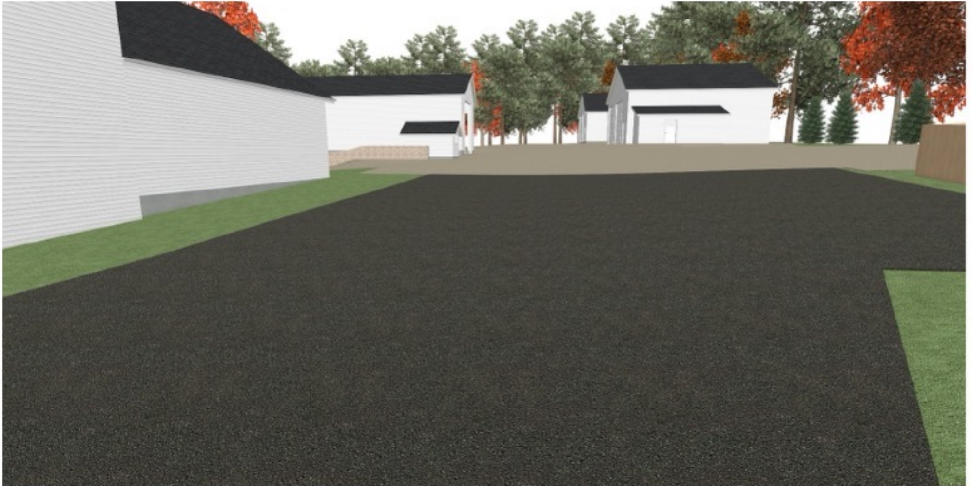
Concept drawing for Option 4 – With Sand Shed – View from Library Driveway