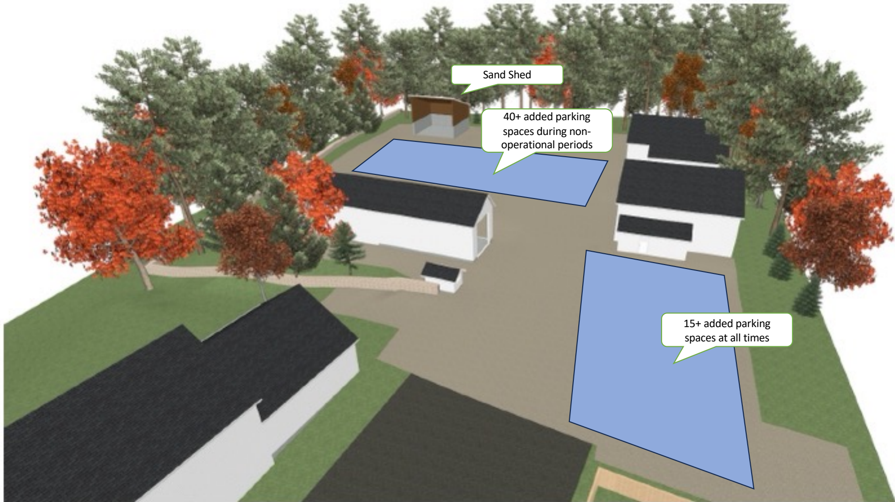
Concept drawing for Option 4 with Sand Shed – Added Parking